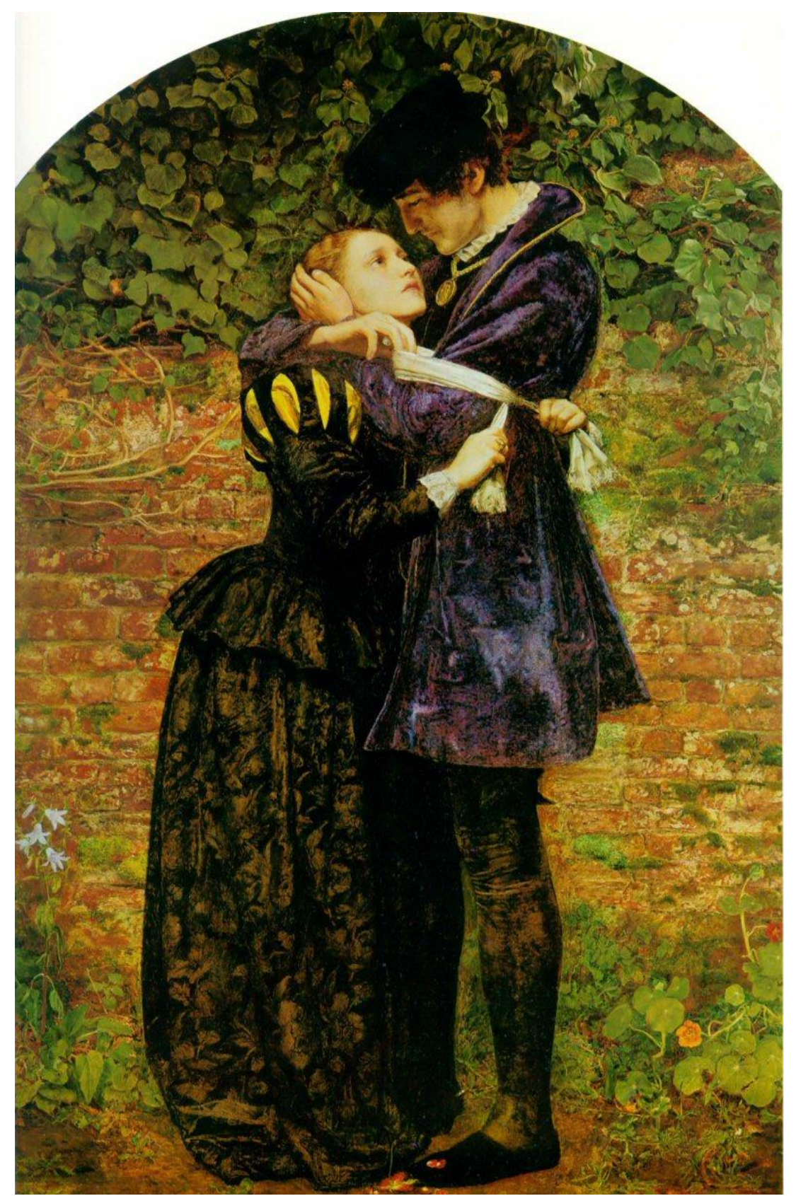
John Everett Millais, 1852. HUGUENOT LOVERS ON ST. BARTHOLOMEW'S DAY